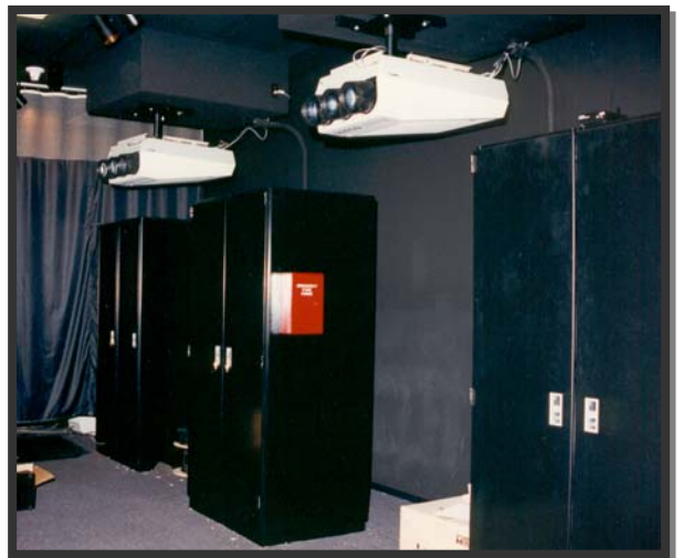
High-Resolution Video Projection Equipment