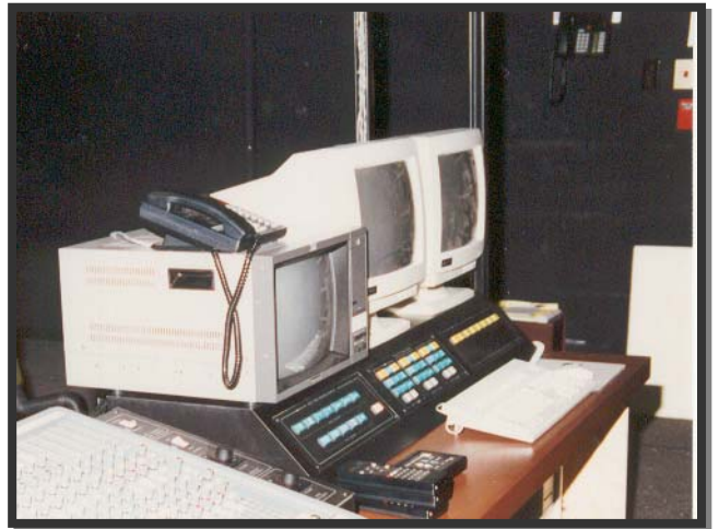
System Control Station