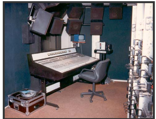
700 Seat Projection and Sound Control