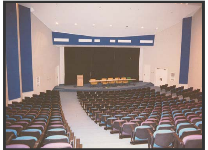
700 Seat Theater